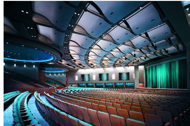
Minneapolis Convention Center