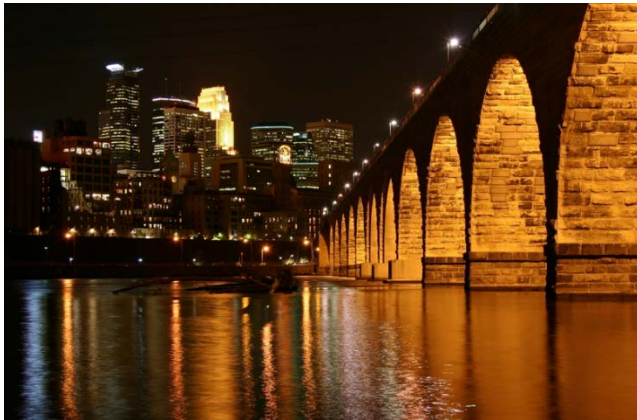
Stone Arch Bridge

Festival is the signature event of GALA Choruses. Festival 2020 will be held in Minneapolis on July 4-8, 2020 with more than 150 performing groups and 6,500 singers expected! Look on the GALA web site for a complete description of the performance opportunities and tools to help your chorus prepare for the festival experience.