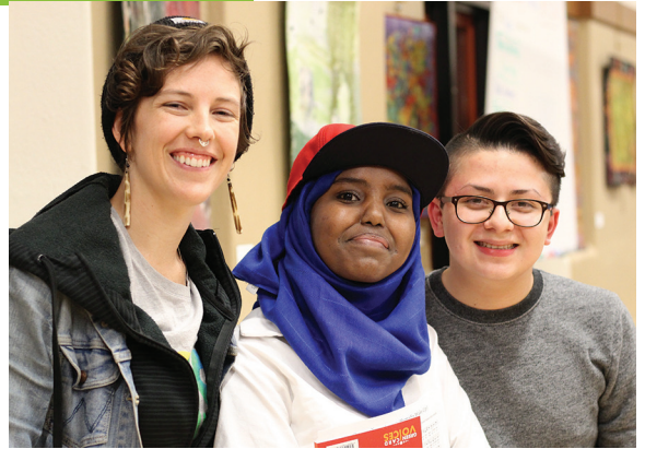
One Voice Mixed Chorus collaboration with Green Card Voices

In order to be eligible, applicants must be a GALA Choruses member in good standing (or the fiscal sponsor of a current member), and a registered non-profit organization. Applicants may request an amount between $2,500-$5,000, and must match the provided amount by at least a 1:5 ratio (for example, a request for $5,000 would require a $1,000 match). Funds must be used to support programming that includes both the chorus members and community partner participants. Applications seeking to use funds merely to subsidize concerts or programs involving only a Chorus and its members will not be considered. Events may be ticketed, but ticket prices must be accessible to the community partner's population. Non-traditional programming, such as informal music-making in non-traditional spaces, is highly encouraged.