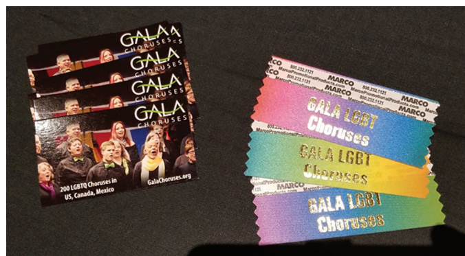
GALA artistic directors handed out wallet cards and wore badge ribbons.