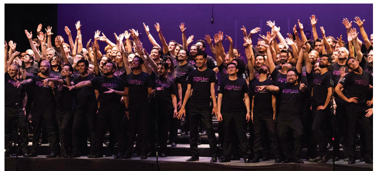
Coro Gay Ciudad de México

Together, we will raise the funds required to change our world through song by making Festival 2020 the most welcoming celebration of LGBTQ voices in history. Your support for the Festival Inclusion Fund makes all of this possible. Opportunities to support this campaign are available during registration and on the GALA website.